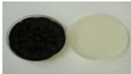
Aspergillus niger ATCC 16404 : METHYL+PROPYL PARABEN (2:1) 0.05%

Left : without Parabens Right :with Parabens