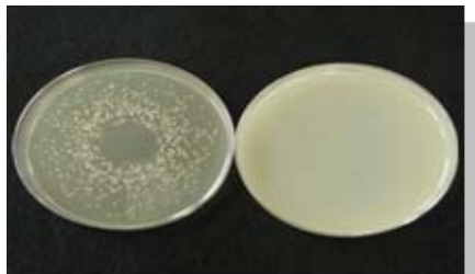
Pseudomonas aeruginosa IFO 13275 : METHYL+PROPYL PARABEN (2:1) 0.2%