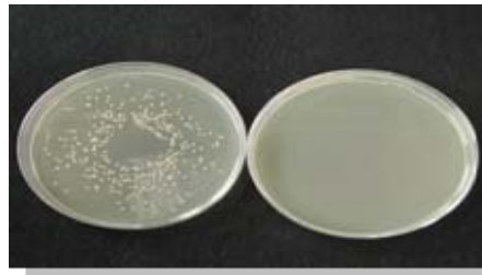
Staphylococcus aureus IFO 13276 : METHYL+PROPYL PARABEN (2:1) 0.1%