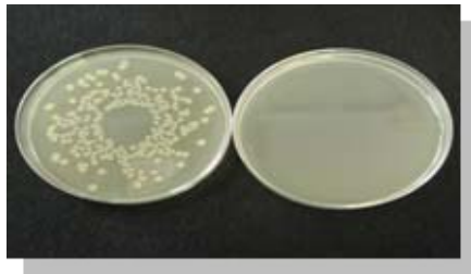
Escherichia coli IFO 3972 : METHYL+PROPYL PARABEN (2:1) 0.1%